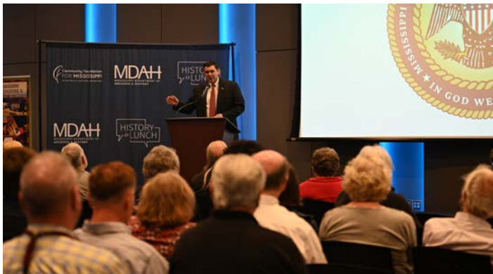
Commissioner Andy Gipson discusses the Department of Agriculture and Commerce during History Is Lunch .