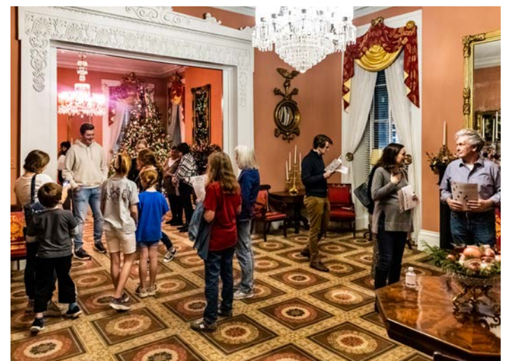
Visitors tour the Mississippi Governor's Mansion during Christmas By Candlelight.