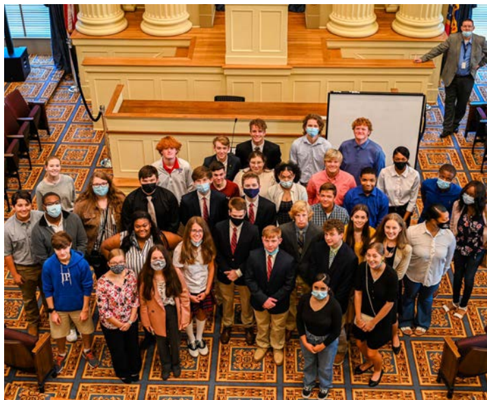
High school students gather in the House Chamber before competing against one another in the Old Capitol Bowl.