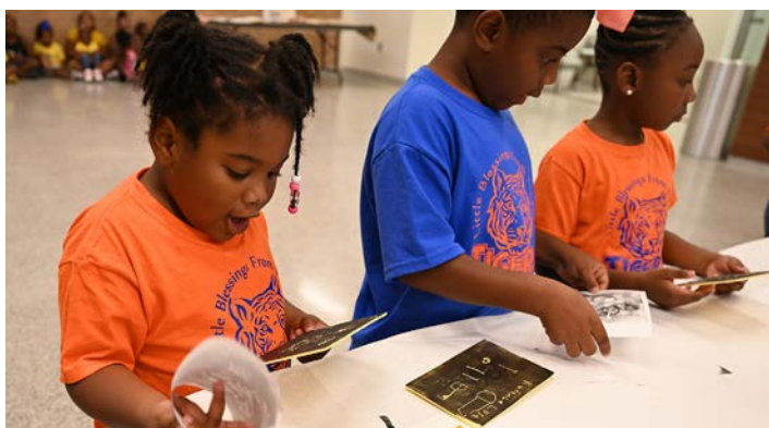
Children make prints during Field Trip Friday at the Two Mississippi Museums.