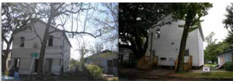
The Rectitude Masonic Lodge in Gulfport before and after rehabilitation

Two other notable rehab projects were the Rectitude Masonic Lodge and the Soria City Masonic Lodge, both in Gulfport, which have been