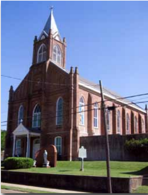
Holy Family Catholic Church, Natchez