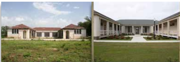
The Randolph School in Pass Christian before and after rehabilitation

Among the many outstanding rehabilitations completed with HRG funding during FY 2012 are three former schools constructed in the 1920s with grant assistance from the Julius Rosenwald Foundation, which was established to help provide educational facilities for African-Americans. The Walthall County Training School near Tylertown is now owned and managed by the school's