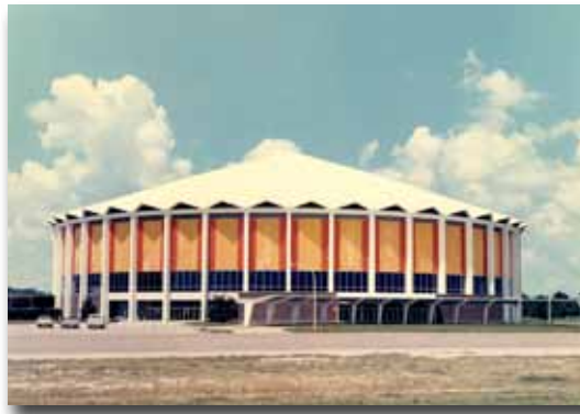
Mississippi Coliseum in Jackson, 1960s.

department's Historic Resources Database contains images of buildings across Mississippi, plus information such as drawings, newspaper clippings, and other historical documents related to the structures. Users can search by location, style, age, and other categories.