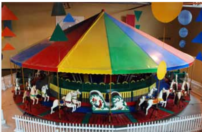
The Armitage Herschell Carousel at the E.E. Bass Cultural Arts Center in Greenville

The MDAH Flickr page was launched in summer 2012 and it will highlight the department's digitized collections.